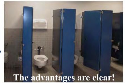
The advantages are clear!

The most popular non-smoking enforcement system in the world