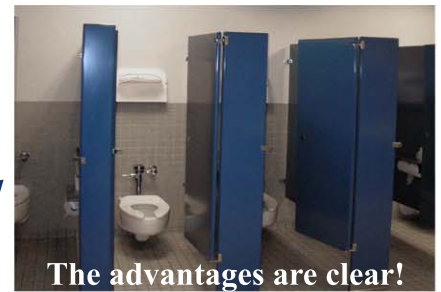
The advantages are clear!

The most popular non-smoking enforcement system in the world